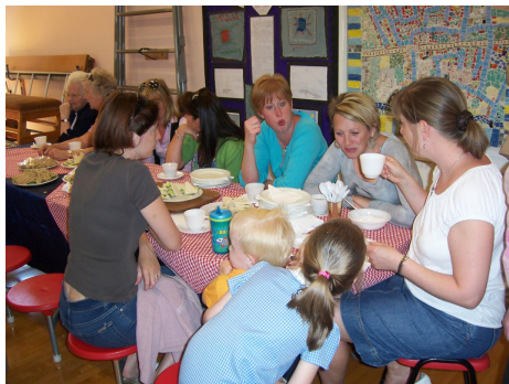
Parents and children celebrated the Royal Wedding with us